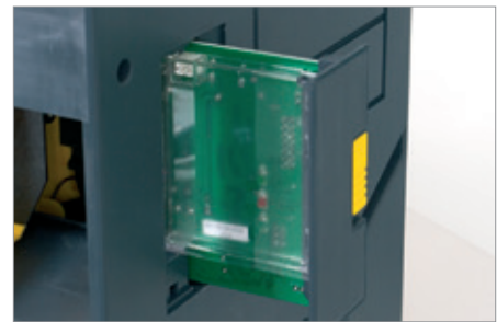
Board easily extractible from the outside