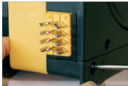
Transformation from standard to adjoining version